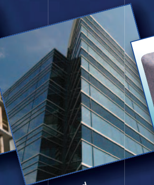
Offices and Corporate Buildings