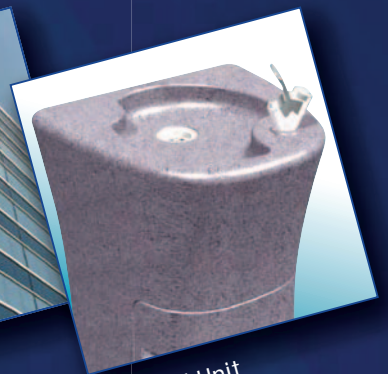
Standard Unit (bubbler only)