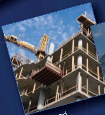
Building and Construction Sites

Design Registration No. 158110. Unit depicted has optional Glass Filler fitted.